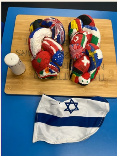
Detail of 'The Scattered Nation Returns' - Sinai Jewish Primary School, Year 3 and 4

Alma Primary Clore Shalom School Clore Tikva School Eden Primary Etz Chaim Jewish Primary School Hillel Day School, USA Jewish School of Helsinki, Finland Kerem School King David Primary, Manchester Mathilda Marks-Kennedy Jewish Primary School North Cheshire Jewish Primary Sacks Morasha Jewish Primary Sinai Jewish Primary School Stratford National School, Dublin, Ireland