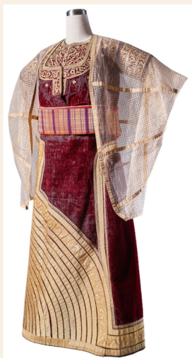
Moroccan Wedding Dress - ANU: Museum of the Jewish People